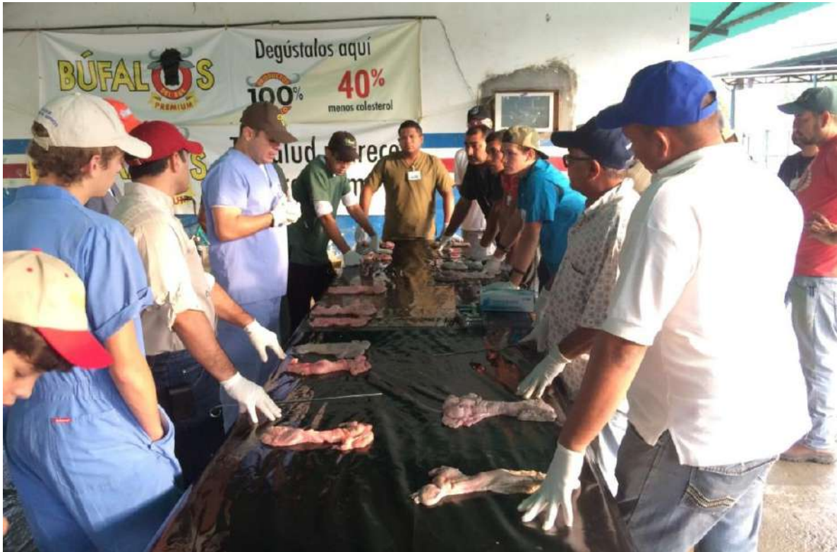
A PRACTICAL SECTION ON REPRODUCTIVE TRACTS DURING THE SECOND ARTIFICIAL INSEMINATION'S TRAINING COURSE IN BUFFALOES, ORGANIZED BY THE RESEARCH UNIT OF ANIMAL REPRODUCTION FROM THE UNIVERSITY OF ZULIA (JUAN CARLOS GUTIÉRREZ-AÑEZ PHOTO 2016; HERD: BUFASUR, SANTA BÁRBARA, ZULIA STATE).

Barring two states, the Capital District (Caracas) and Margarita Island, the buffalo population is distributed across the whole Venezuelan territory (Montiel-Urdaneta, 2008), which reflect the good adaptation of this species to different ecosystems. Venezuela's ecosystems throughout the country seem to be conducive for buffalo production, which has given this animal a privileged position in terms of protein contribution vis-à-vis other livestock species, despite the worst economic and political situation ever faced in the country in the last century.