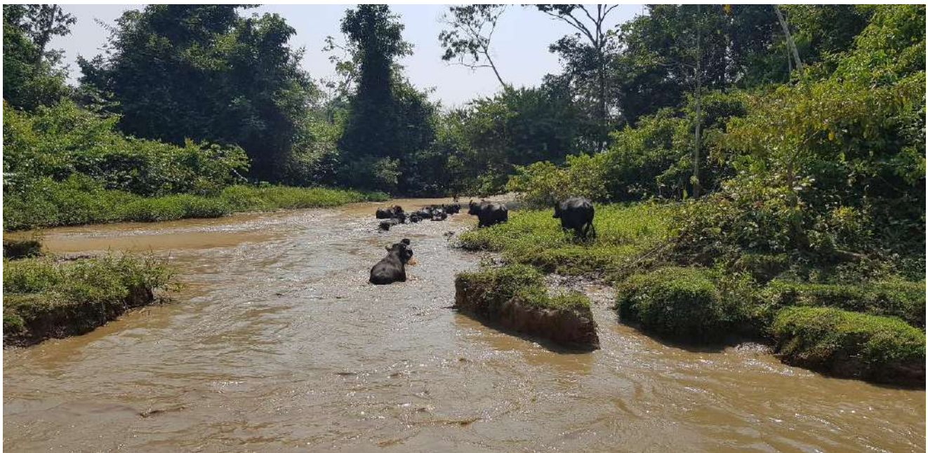
WATER BUFFALO ADAPTED WITHOUT ANY PROBLEM TO LOWLANDS OF THE TROPIC OF COCHABAMBA -BOLIVIA