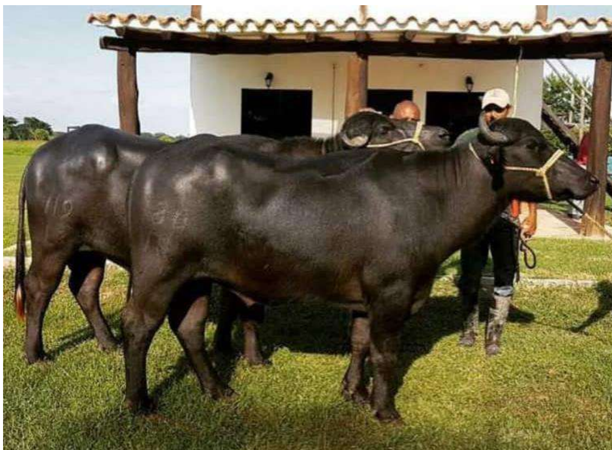
YOUNG MURRAH BULLS PREPARED TO A LIVESTOCK EXHIBITION AND AUCTION (MANUEL MAZZEI PHOTO 2015; HERD: AGROPECUARIA CANTARRANA, VENEZUELAN PLAINS "LOS LLANOS" AT THE SOUTH-WEST OF THE COUNTRY, BARINAS STATE)

However, the Venezuelan Buffalo's Breeders Association (CRIABUFALOS), which counts on records of 500,000 animals and more than 190 members, estimated that the total herd in Venezuela is between 1,800,000 and 2,000,000 heads considering non registered independent breeders (Nicola Fabbozzo, President of CRIABUFALOS, personal communication).