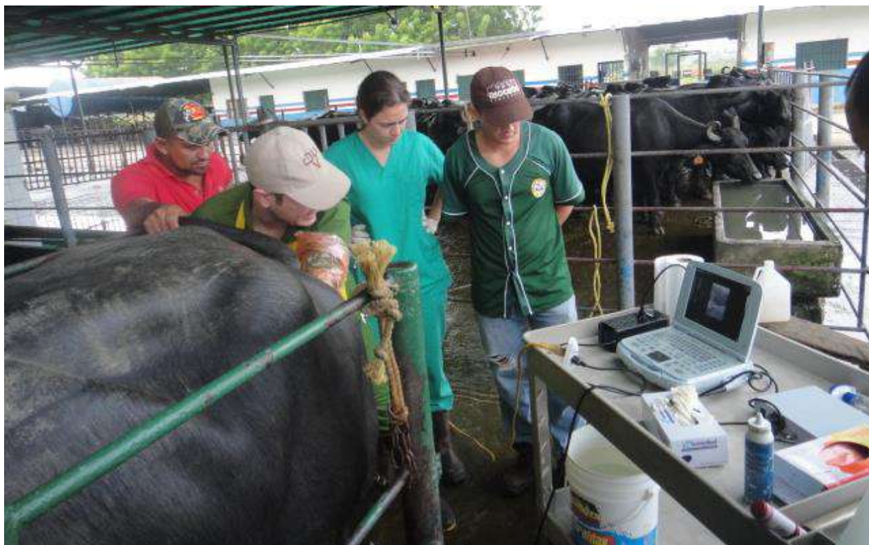
ULTRASONOGRAPHY PERFORMED ON A BUFFALO COW DURING THE TRAINING COURSE ABOUT BUFFALO'S GYNECOLOGY AND REPRODUCTIVE ULTRASONOGRAPHY, ORGANIZED BY THE RESEARCH UNIT OF ANIMAL REPRODUCTION FROM THE UNIVERSITY OF ZULIA AT BUFASUR FARM (J.C. GUTIÉRREZ-ANEZ 2017)

that obtained with cattle through feeding-based on natural pasture. At present, buffalo livestock activities contribute to about 400,000 and 100,000 tons of milk and meat, respectively to the Venezuelan food market annually (CRIABUFALOS estimation).