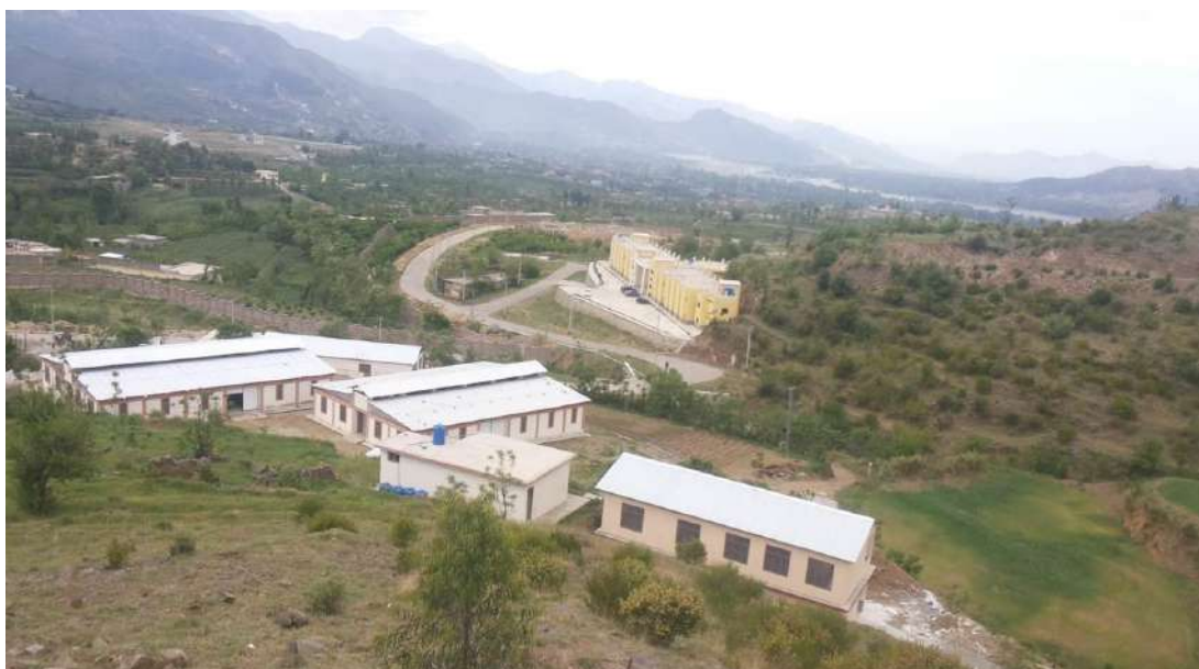
AERIAL VIEW OF AZIKHELI BUFFALO FARM CHARBAGH SWAT

Azikheli Buffalo is a docile animal and even children and women can comfortably handle them, being a domestic animal, hence show great affinity to the house hold & react to the strangers aggressively. Well-fed males and even female can serve as good beef animals, especially for sacrificial purposes. The average body weight ranges between 350-450 Kg while average age at first calving is 45 months with the lactation period of 300 days. Average Fat % found in milk is 6.5 and the taste of milk, yogurt and ghee is quite pleasant.