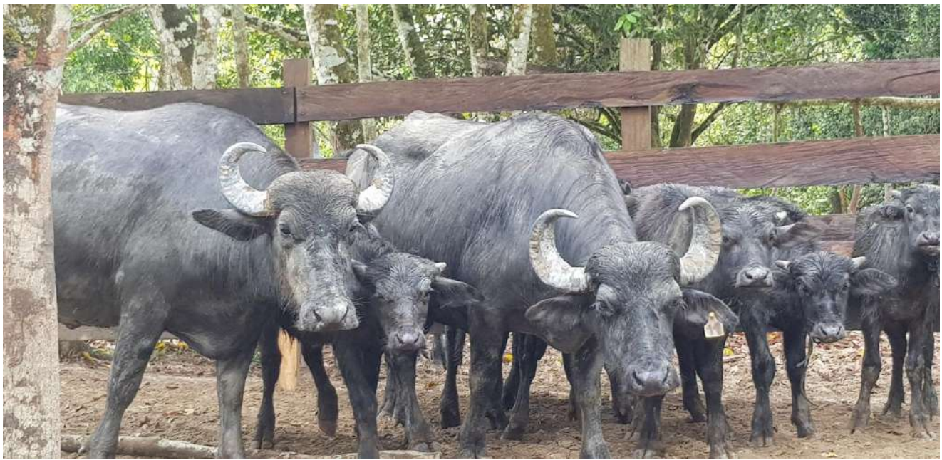
MEDITERRANEAN BUFFALOES WITH CALVES IN THE CATREN-FCAPyP OF THE UMSS (TROPICO DE COCHABAMBA-BOLIVIA)