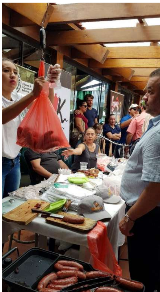
TASTING AND SALE OF BUFALO' CHEESE AND CHORIZO MEAT PROMOTED BY ASSOCRIABUF-BOLIVIA