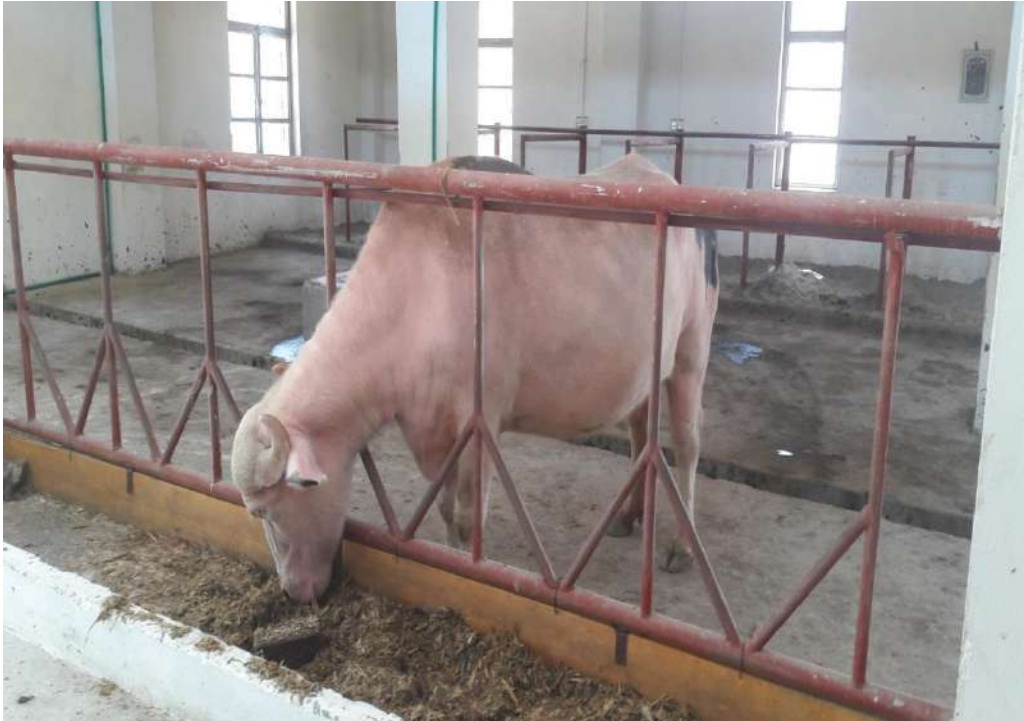
AZIKHELI BUFFALO TAKING SILAGE FEED AT AZIKHELI BUFFALO FARM CHARBAGH SWAT