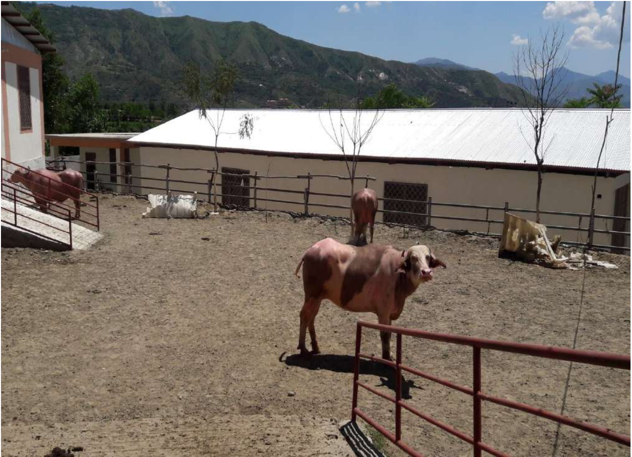
AZIKHELI BUFFALO IN Paddock AT AZIKHELI BUFFALO FARM CHARBAGH SWAT

Farm Manager at Azikheli Buffalo Farm Swat, Livestock & Dairy Development Department KPK - Pakistan