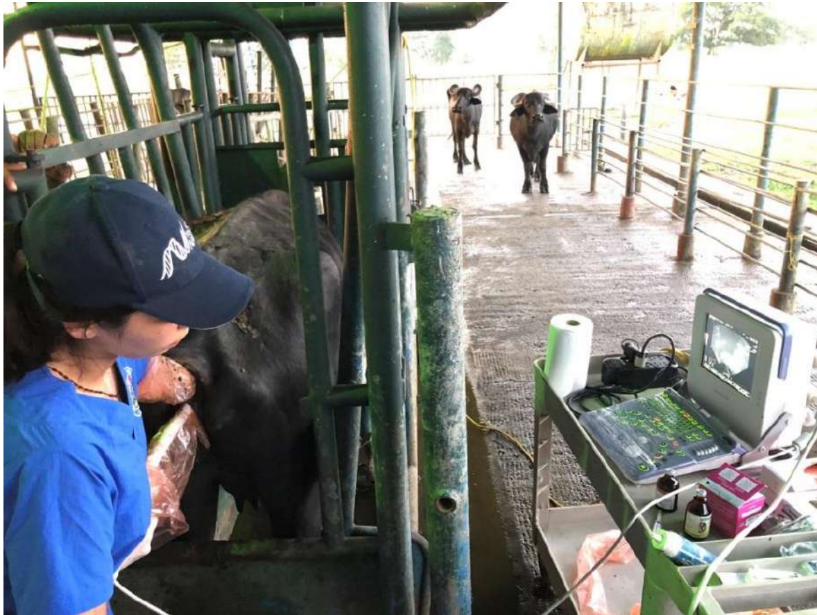
OVUM PICK UP (OPU) SESSION PERFORMED ON A BUFFALO COW DURING OPU-TRAINING COURSE ORGANIZED BY THE RESEARCH UNIT OF ANIMAL REPRODUCTION FROM THE UNIVERSITY OF ZULIA AT BUFASUR FARM

Standing out among these, we have organized the courses on artificial insemination, gynecological evaluation, reproductive ultrasonography, as well as embryo technology including ovum pick up (OPU) and in vitro embryo production.