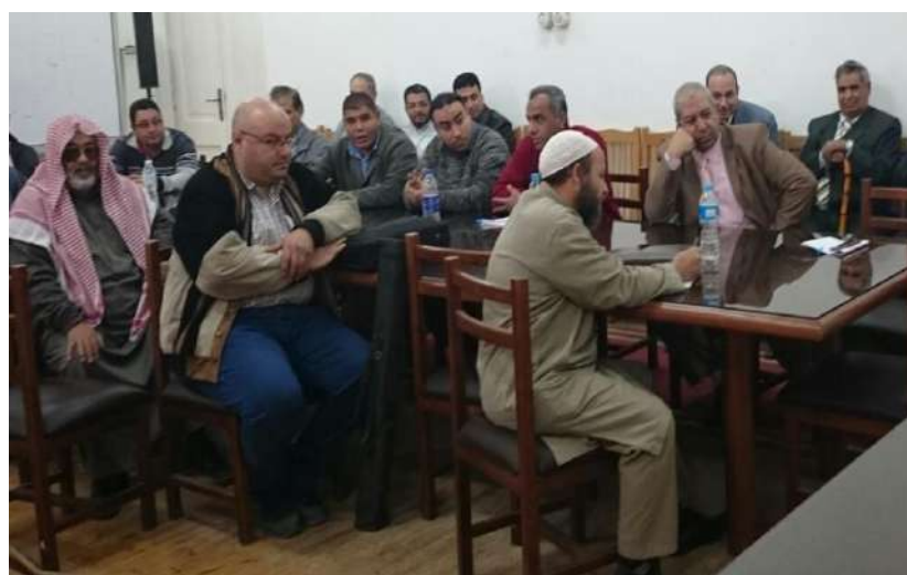
MEETING WITH SOME BUFFALO BREEDERS HELD MONTHLY BY THE EGYPTIAN ASSOCIATION FOR IMPROVING EGYPTIAN BUFFALO

To pinpoint strengths and weakness in the buffalo production system in Egypt, the recording of performance data and pedigree at the small breeding units (small holdings; 2-5 heads) is considered as the driving force for management of a national plan genetic improvement. However, this notable step still exposed to great challenges such as financing and credit services, technical guidance for characterization, electronic identification tags and networks, in addition to policy-related constraints.