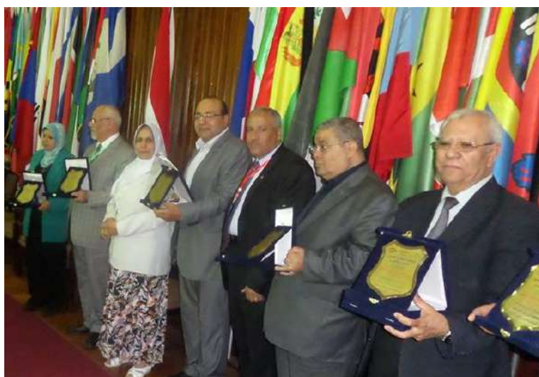
HONOURING OF SOME OF THE PIONEERS IN THE BUFFALO BREEDING RESEARCH FROM THE ANIMAL PRODUCTION RESEARCH INSTITUTE AND EGYPTIAN UNIVERSITIES