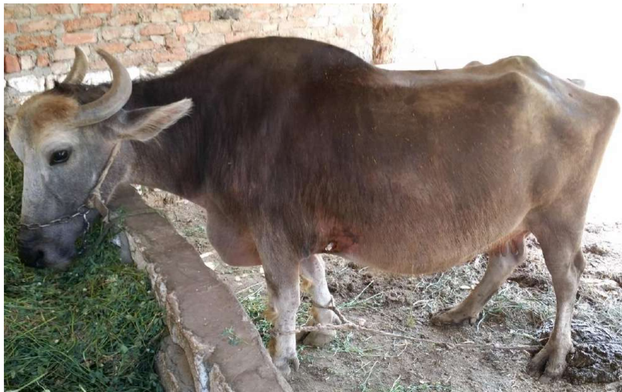
FIGURE 2. EGYPTIAN BUFFALO RAISED IN NILE VALLEY GOVERNORATES

Egyptian buffalo is also adapted to the environmental and managerial conditions in Egypt. The suitability of the buffalo to the Egyptian hot climatic conditions is shown to be achieved by