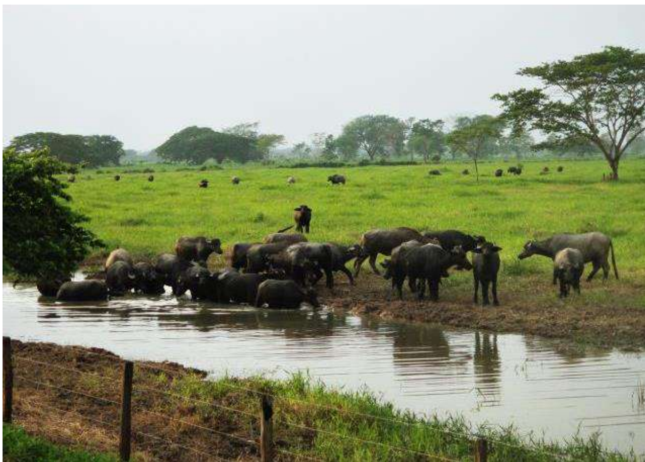
CROSSBRED MEDITERRANEAN x MURRAH PREGNANT HEIFERS COOLING IN AN ARTIFICIAL WATER CHANNEL IN THE BIGGEST BUFFALO FARM FROM VENEZUELA (22.000 HEADS) LOCATED AT THE SOUTH REGION OF MARACAIBO LAKE ( ; HERD: BUFASUR, SAN CARLOS, ZULIA STATE)

Nevertheless, nowadays, most of the buffalo population in the country have been well defined towards either Murrah or Mediterranean or crossbreed derived from both, thanks to the genetic selection and remarkably to the use of those breeds in pure state either through the artificial insemination (AI) or through natural mating by using bulls produced by AI in recognized farms that have been using that biotechnology as a genetic improvement tool for 25-30 years.