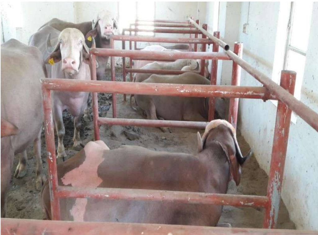
AZIKHELI BUFFALO TAKING REST IN CUBICLE IN AZIKHELI BUFFALO CHARBAGH SWAT