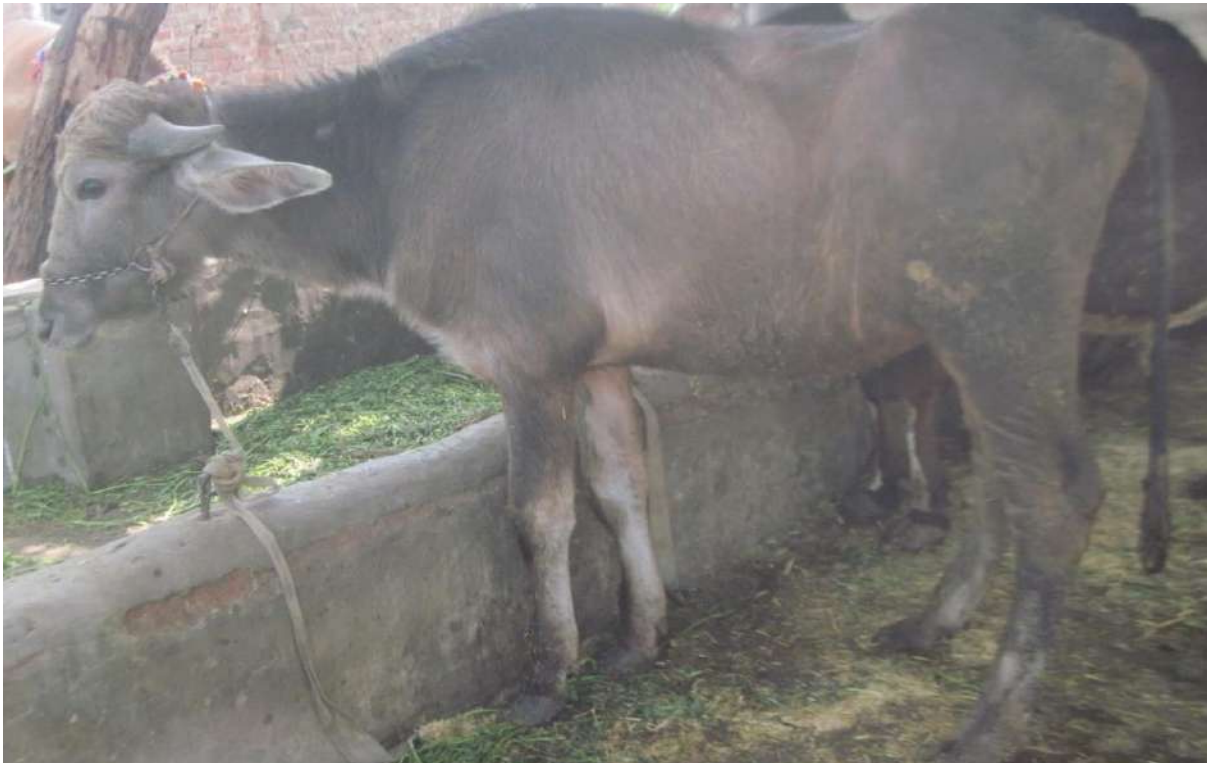
FIGURE 1. EGYPTIAN BUFFALO RAISED IN NILE DELTA

The riverine buffalo breeds ( 2n = 50 ) has been recognized as a dairy animal, spread from the Indian subcontinent to the eastern Mediterranean countries including Egypt. In Africa, the buffalo population accounts for almost 2% of the global buffalo population particularly concentrated in Egypt. The number of buffalo population in Egypt is about 3.7 million head according to FAOSTAT (2017). Egyptian buffalo is not only considered as an important genetic resource with a great potential for milk and meat production, but it is also considered as the main dairy animal raised by small Egyptian farmers.