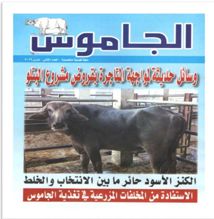
THE BUFFALO QUARTERLY PUBLICATION, PUBLISHED IN SIMPLE ARABIC LANGUAGE

Buffalo sub-populations in Egypt are mainly characterized based on geographical origin within the country, and mostly belongs to one breed (El-Kholy et al., 2007), with little documented phenotypic or morphometric differences that may help in characterizing these sub-populations. In a recent study, Omran et al., (2019), have shown that the recorded values for all the buffalo body measurement were found to be significantly higher ( P \leq 0.001 ) for animals raised in the Nile Delta conditions (Figure 1) as compared to those raised in the Nile Valley conditions (Figure 2), and might be dependent on temperature humidity index (THI). Thus, THI may was found to be the most prominent factor responsible for variations in the animal's morphometric characteristics particularly skin color and thickness. The buffalo animals raised under ND condition had soft, short, heavy and harmonic hair where it was rough, long, slight and sparse for those animals raised under NV conditions.