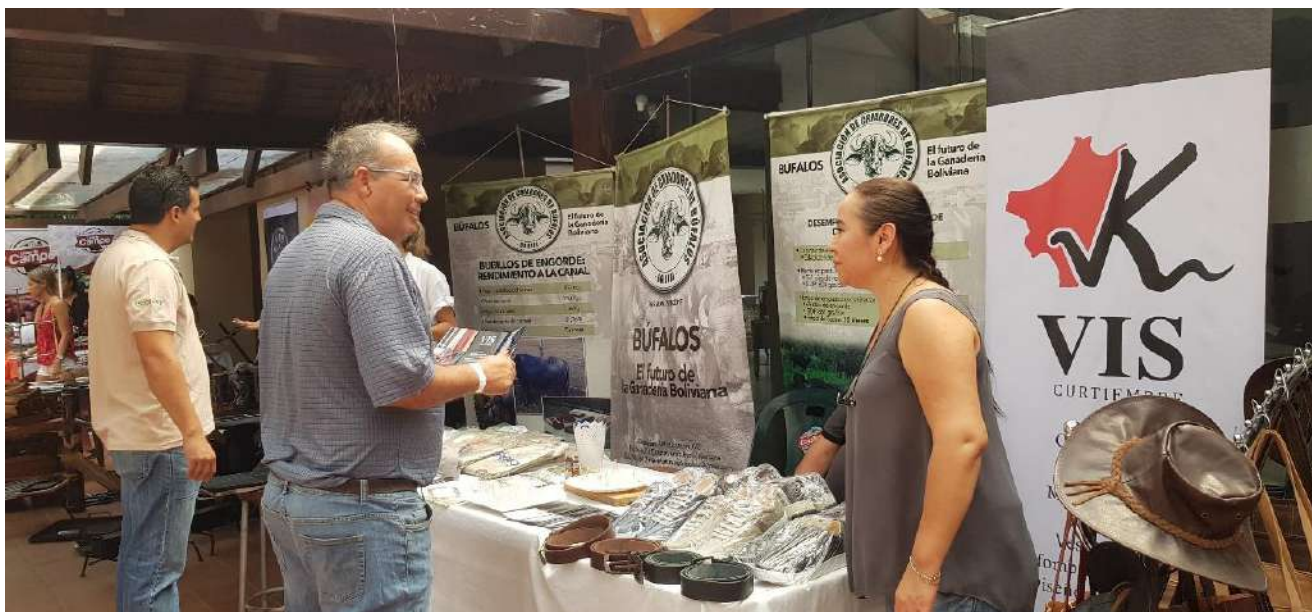
ASOCRIABUF-BOLIVIA, ORGANIZATION OF BOLIVIAN BUFFALO BREEDERS ACTIVE IN THE AGRICULTURE FAIRS OF SANTA CRUZ AND COCHABAMBA.

The first water buffaloes did arrive in Bolivia in 1974, thanks to a common project between the European Community (EU) and the National Institute of Colonization (INC), for productive development support to local settlers, located in the Paraíso community of the Municipality of Puerto Villarroel, José Carrasco province, of the department of Cochabamba. These 200 imported buffaloes were of the Mediterranean breed, coming from the region of Caserta, Italy, which purpose was addressed to both, to promote food security (meat and milk production), as well as for its use in animal traction. Subsequently, most of the imports have been carried out from Brazil, which main buffalo breeds were related to the Mediterranean, Murrah, and Jafarabadi.