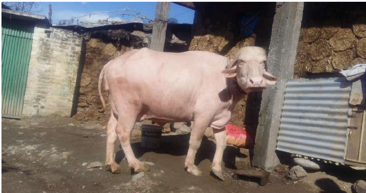
AZIKHELI BUFFALO IN HIS HOME TRACT BINKAT SWAT

Majority of the Azikheli buffalos are housed in some close proximities characterized by darkness with no or poor ventilation and / or water trough facilities. Mangers are narrow and deep which cannot be cleaned properly. In a 10*10 square feet space more than 8 animals along with calves & bulls are kept.