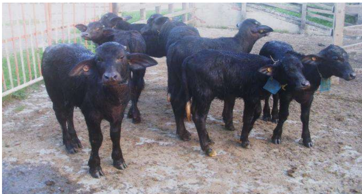
FIRST BUFFALO'S CALVES PRODUCED THROUGH OPU-IVF AND EMBRYO TRANSFER IN VENEZUELA (HERD: BUFASUR, SANTA BÁRBARA, ZULIA STATE)

However, those research and development efforts are not enough to cover other issues of buffalo production concerns such animal and public health (one health), nutrition, management; socio-economics including economic production, industrialization, and commercialization, etc., which could only be addressed in a multidisciplinary national program involving government, the breeders associations, public and private research institutions.