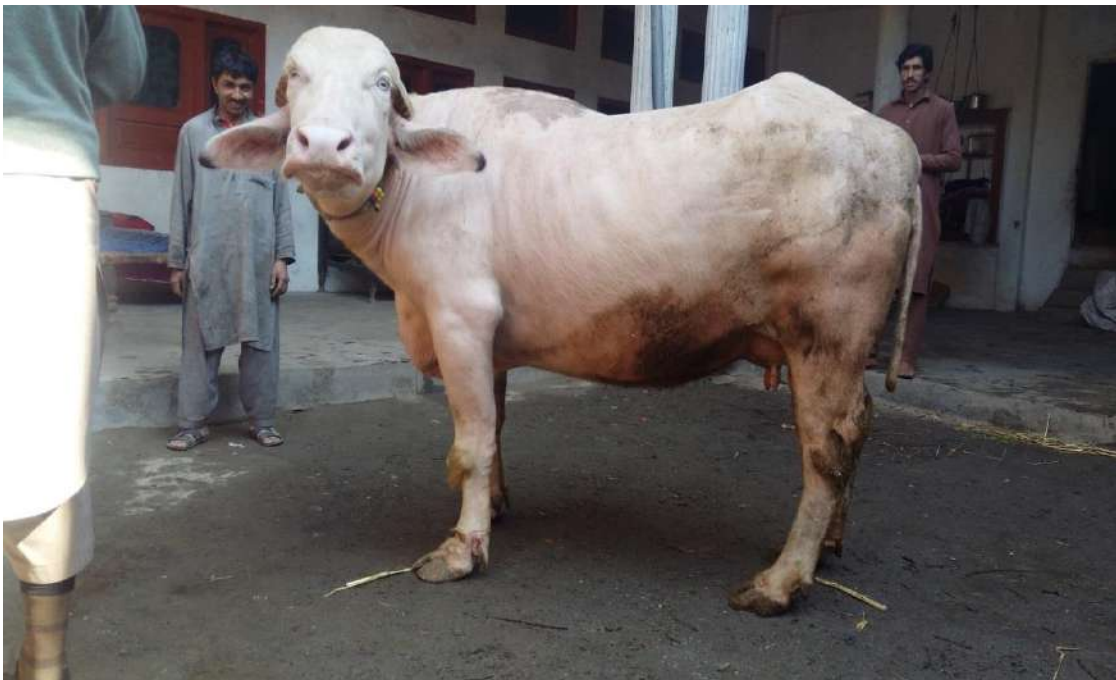
AZIKHELI BUFFALO IN HIS HOME TRACT SHAMAK SWAT