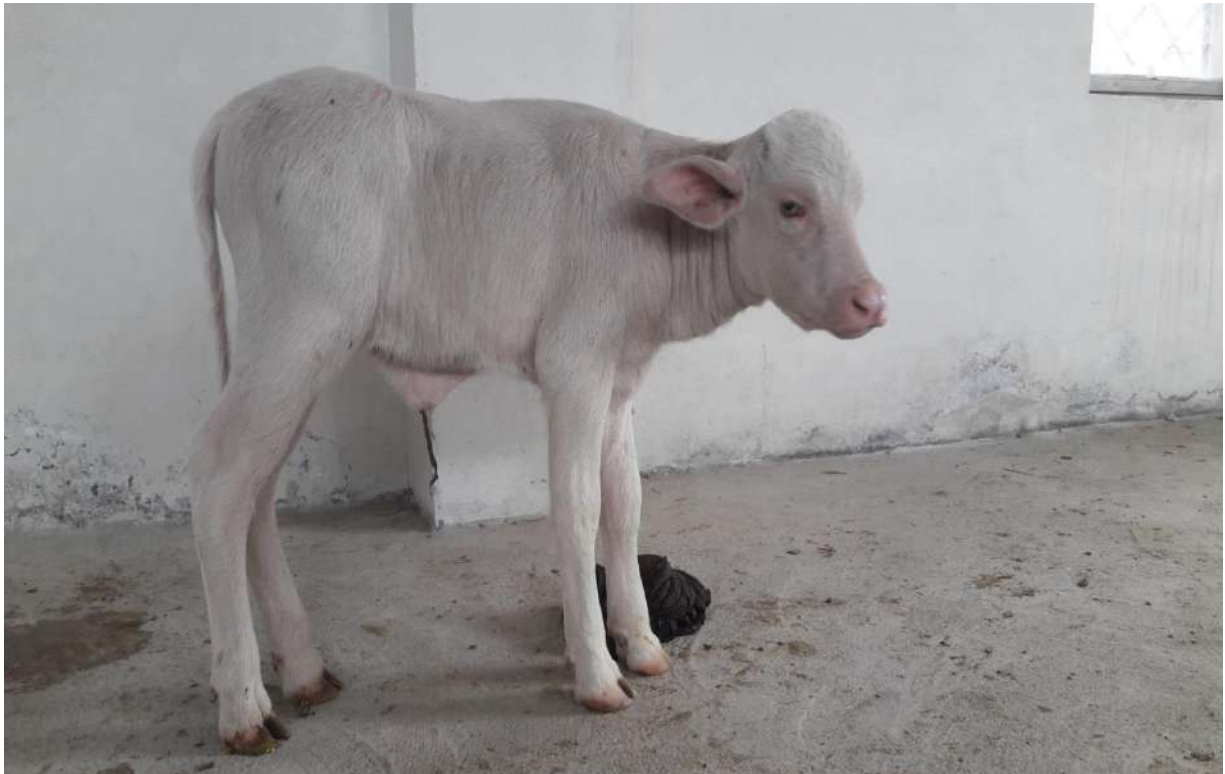
AZIKHELI BUFFALO CALF IN AZIKHELI BUFFALO FARM CHARBAGH SWAT