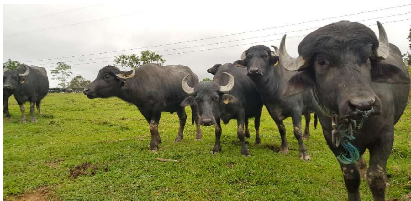
MEDITERRANEAN BUFFALOES BRED ON PASTURE IN THE CATREN-FCAYP OF THE UMSS (TROPICO DE COCHABAMBA-BOLIVIA)