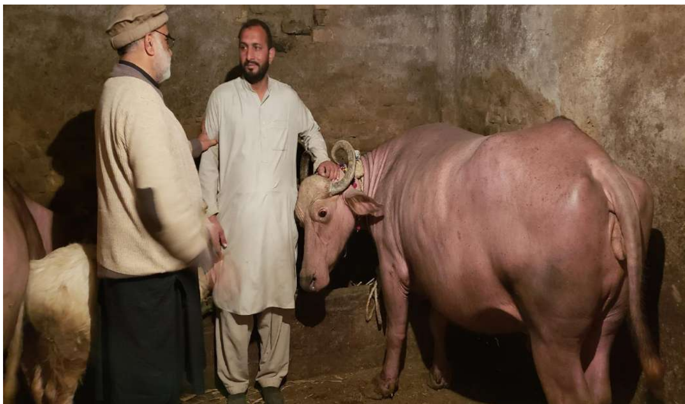
DISCUSSION WITH AZIKHELI BUFFALO PROGRESSIVE FARMER SAMBAT SWAT

The Azikheli buffalo breed is, however, on the verge of extinction due to inappropriate crossing over with the local non-descript and/ or with Nili Ravi. Furthermore, huge numbers of Azikheli buffaloes were lost due to insurgency in the region in the years 2006 to 2009.