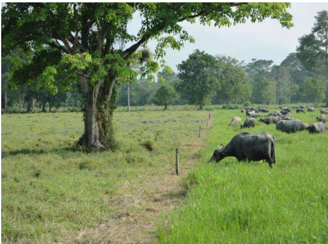
DAIRY BUFFALOES (MEDITERRANEAN X MURRAH) GRAZING IN ONE OF THE MAIN REGIONS FOR BUFFALO'S RAISING IN VENEZUELA IN THE SOUTH REGION OF MARACAIBO LAKE "SUR DEL LAGO DE MARACAIBO" ( ; HERD: C.A., TATUY, SANTA ELENA DE ARENALES, MÉRIDA STATE)

Subsequently, other imports from Europe, specifically from Bulgaria (1978, 1984, and 1992) and Italy (1975, 1976) joined to contribute to buffalo genetic diversity in Venezuela and its improvement in the later years after its introduction. Likewise, the more recently imports from Brazil (2008) of Indian-Murrah pure breed have contributed to such improvement remarkably as well.